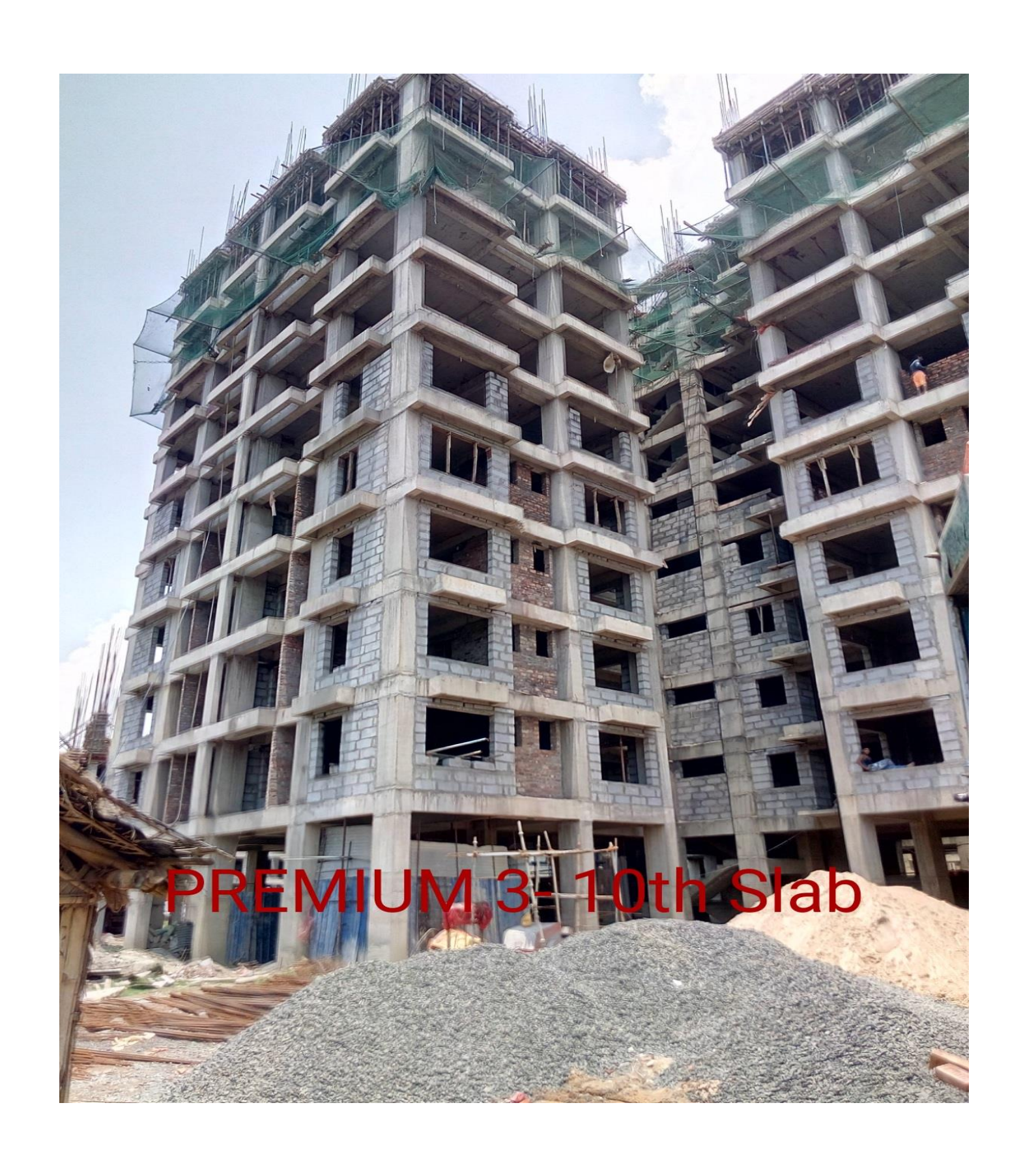
PREMIUM -3- 10th SLAB