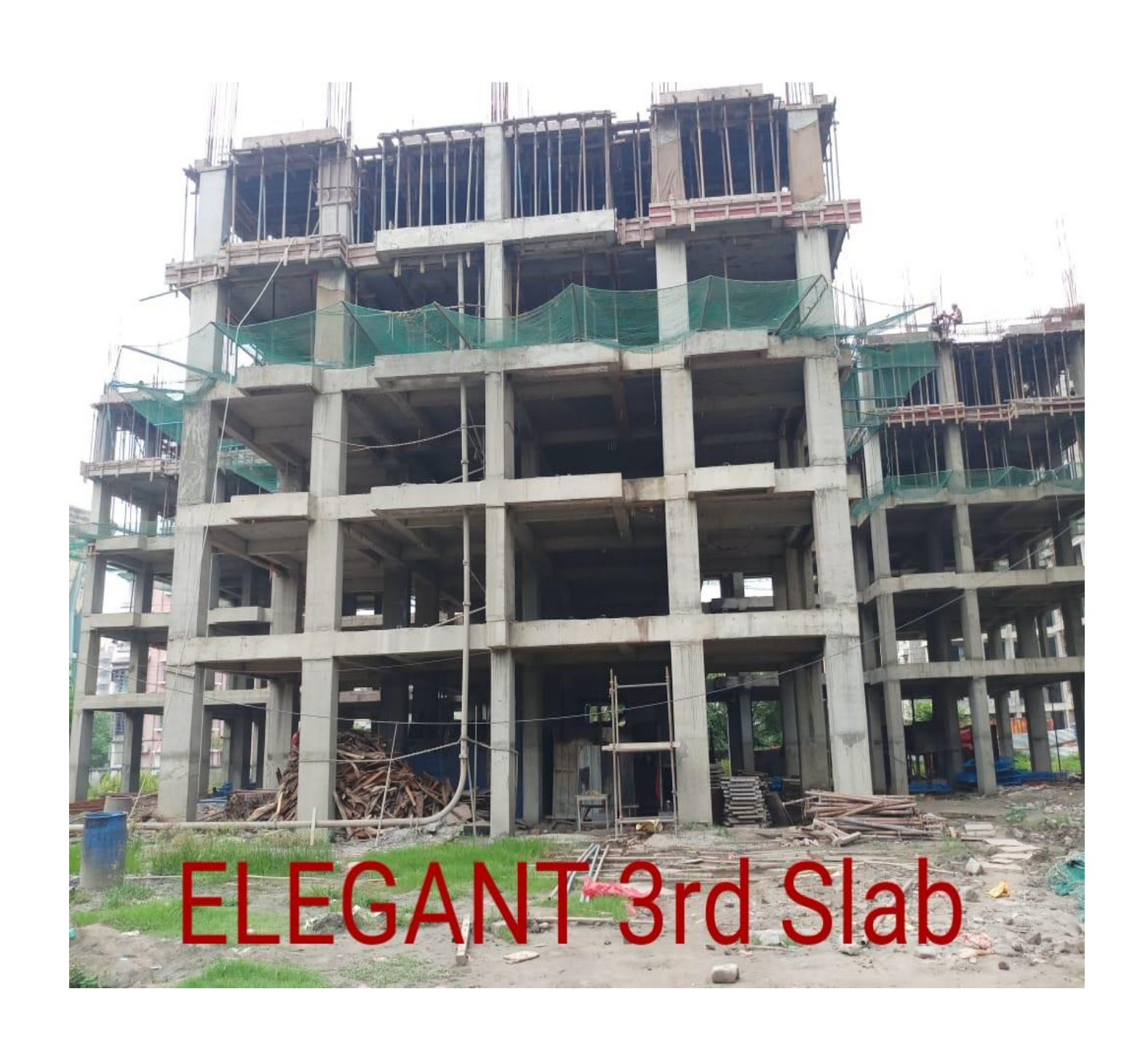
ELEGANT -3rd SLAB