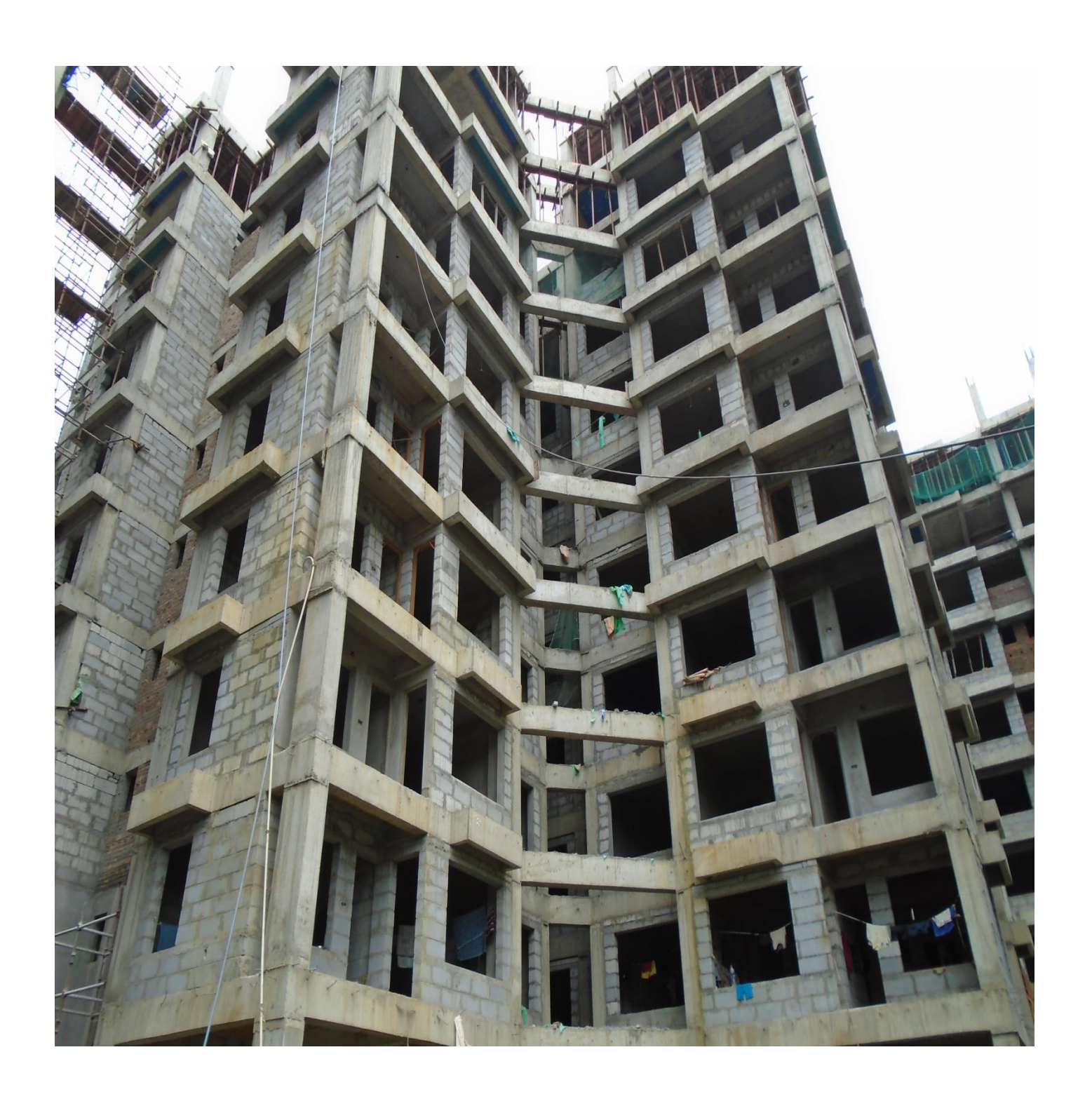
CLASSIC - 3