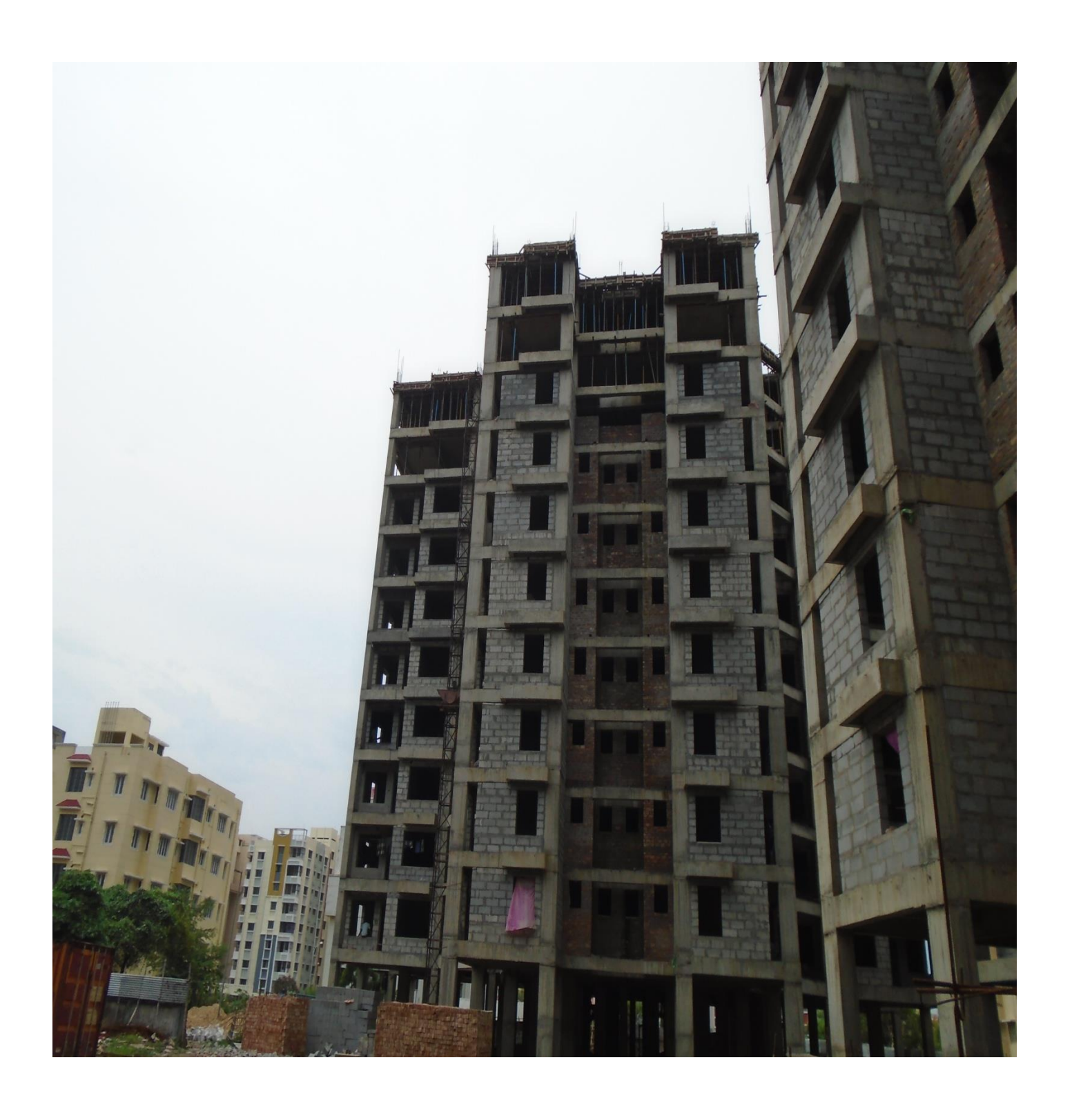
CLASSIC - 1