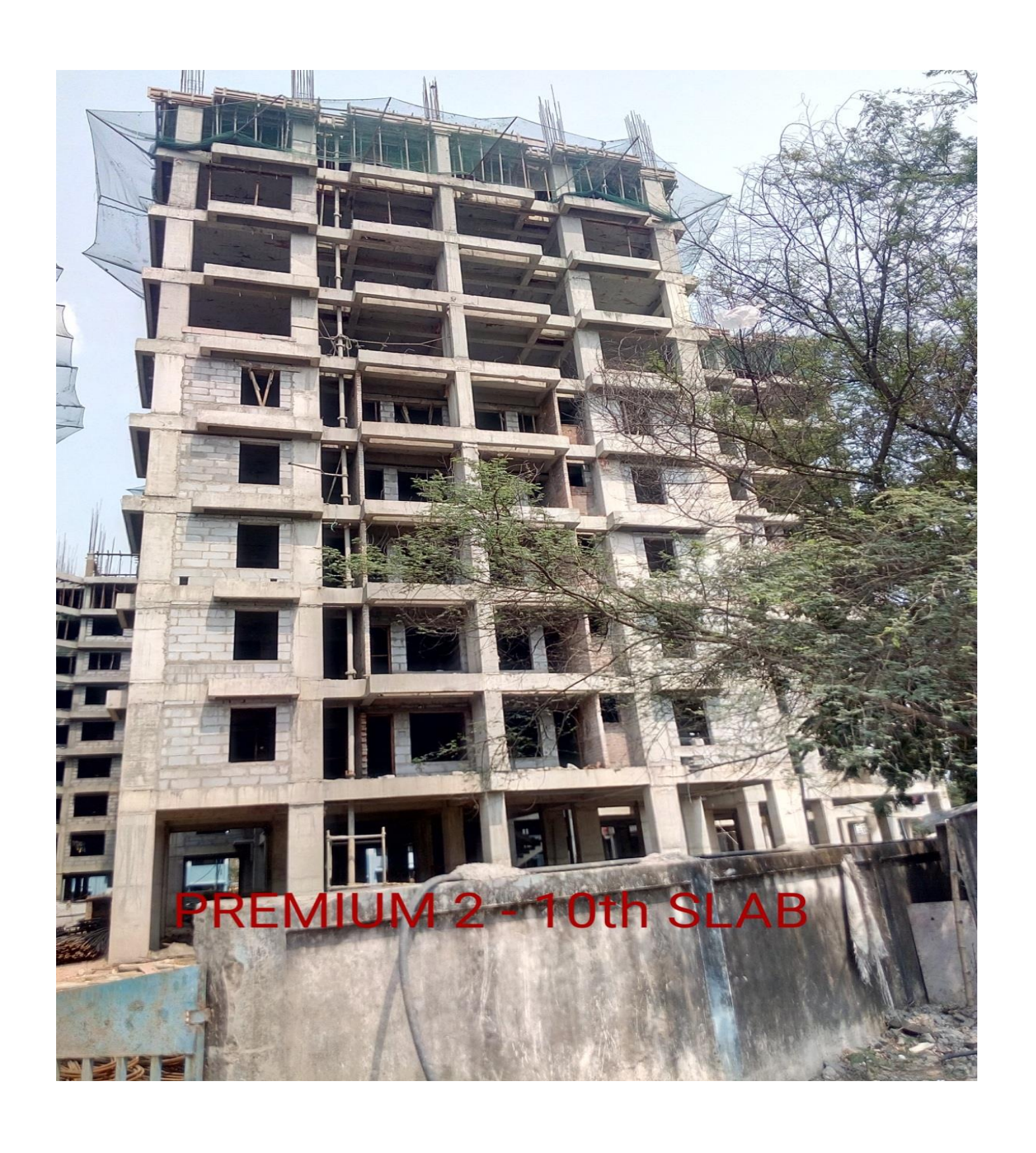
PREMIUM -2- 10th SLAB