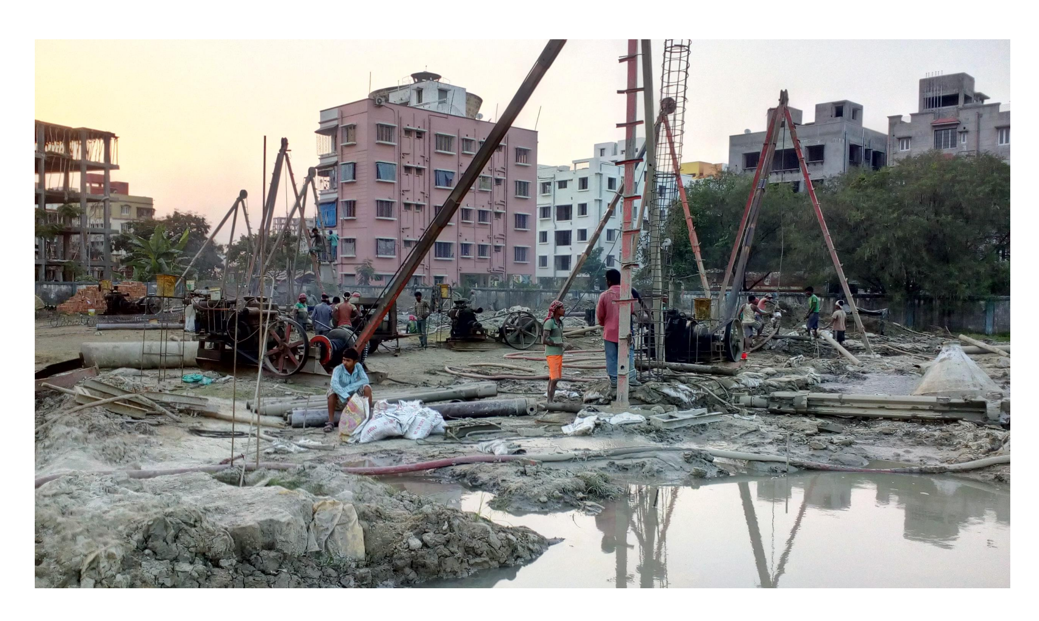
Premium and Elegant 2