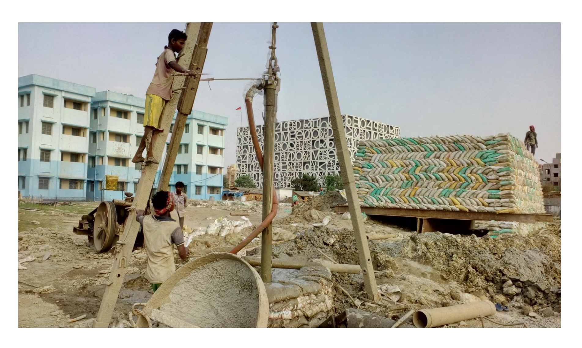
Premium and Elegant 3