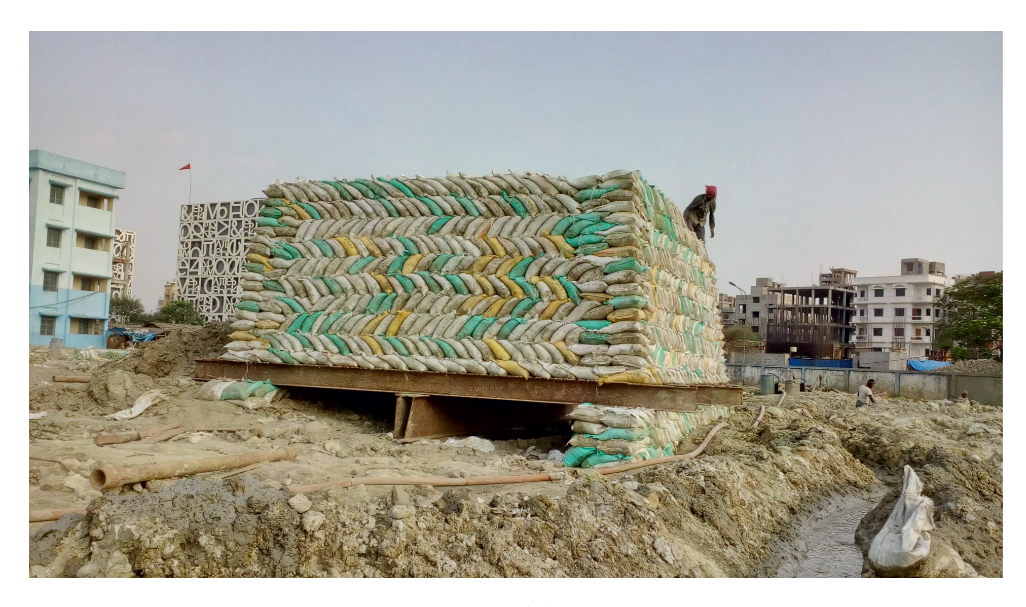
Premium and Elegant 1