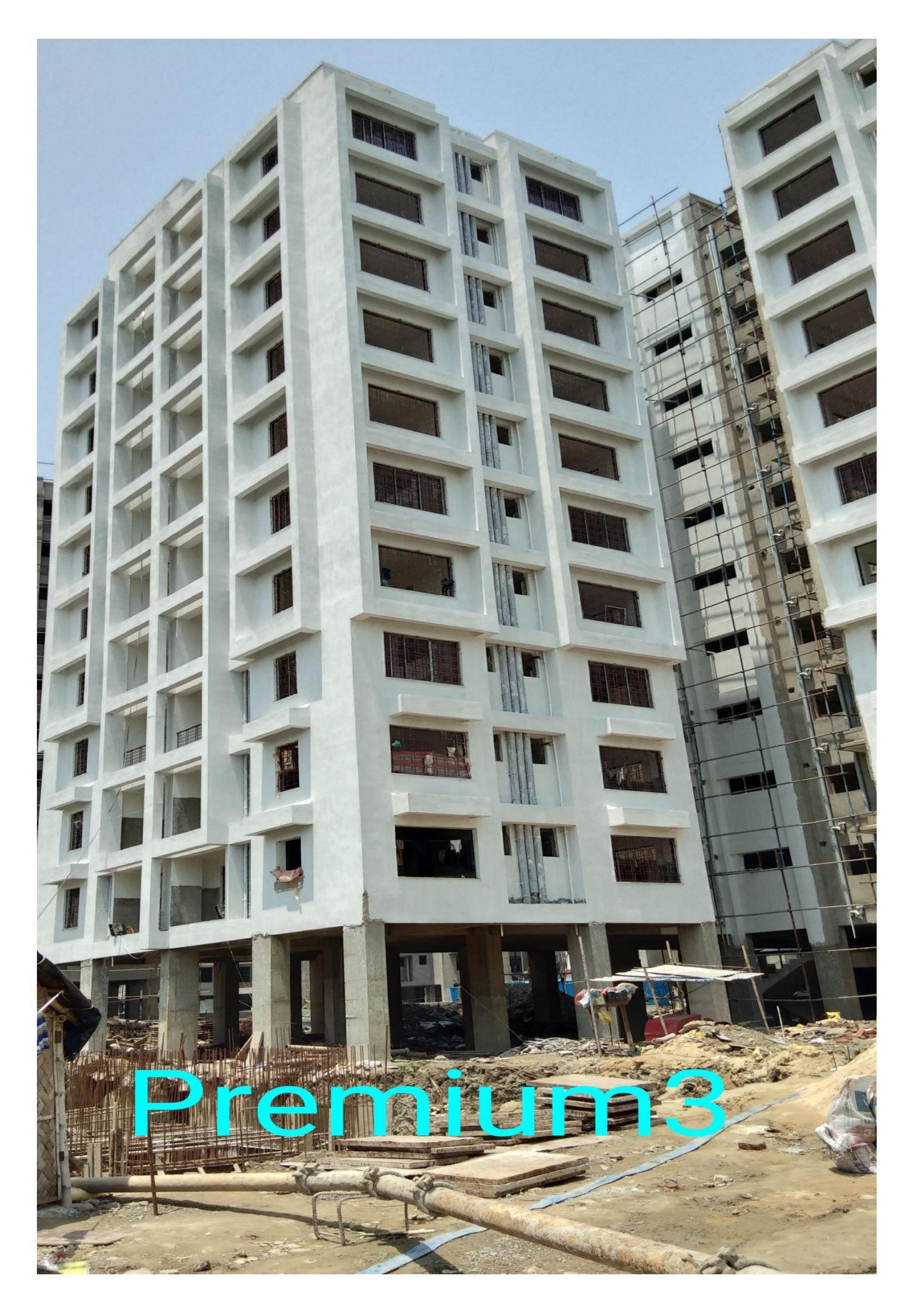
PREMIUM – 3