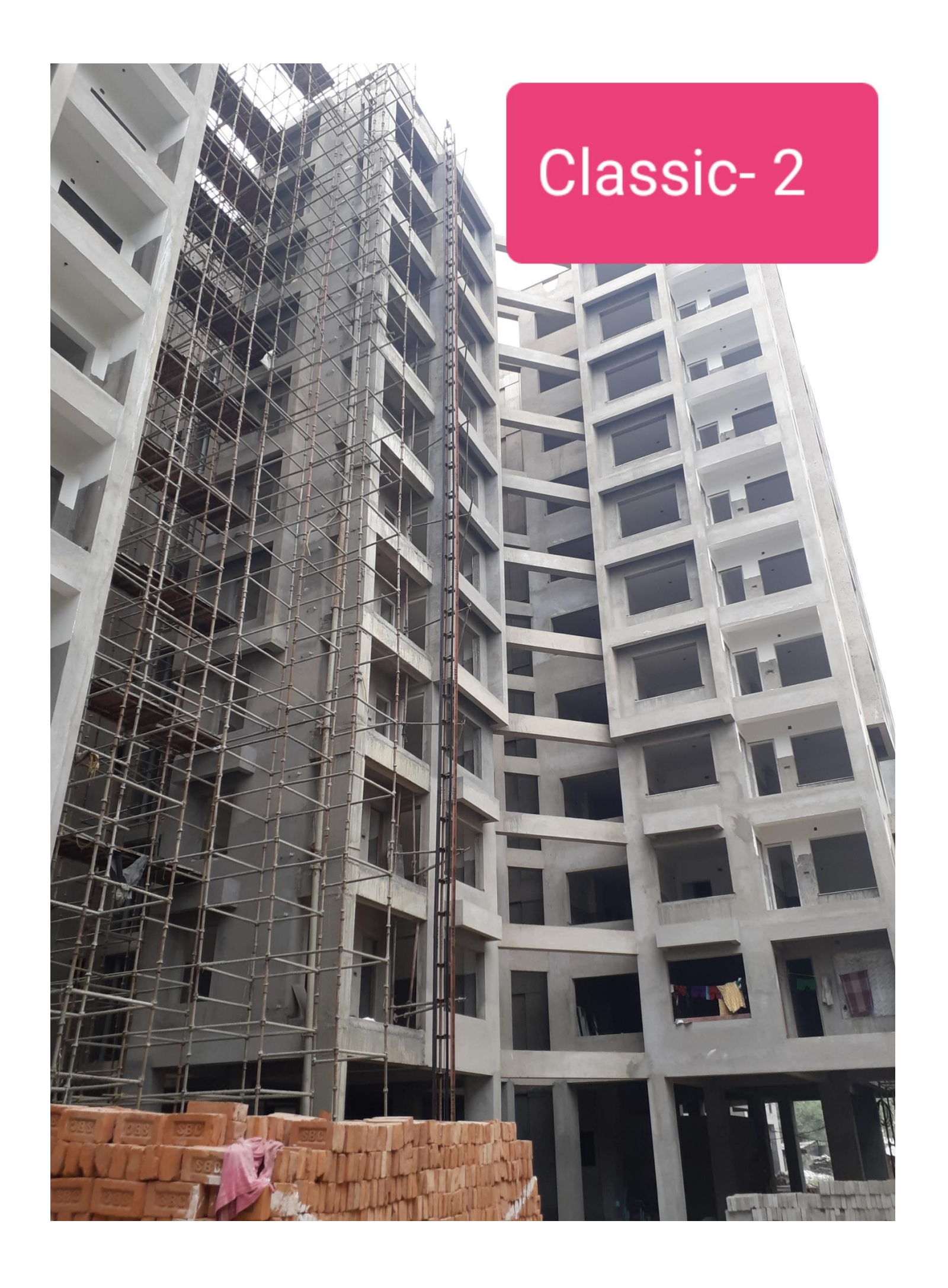
CLASSIC - 2