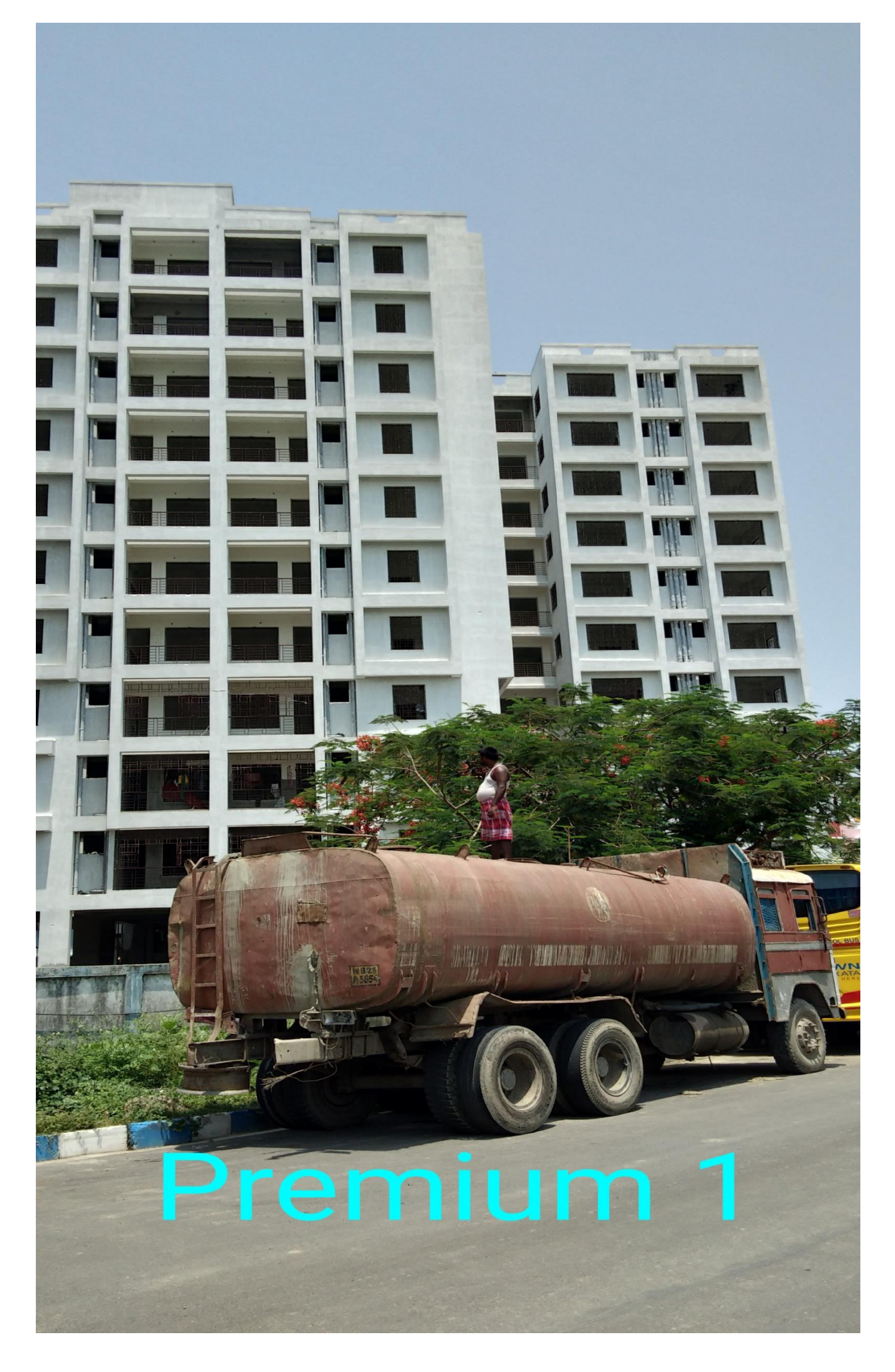
PREMIUM - 1