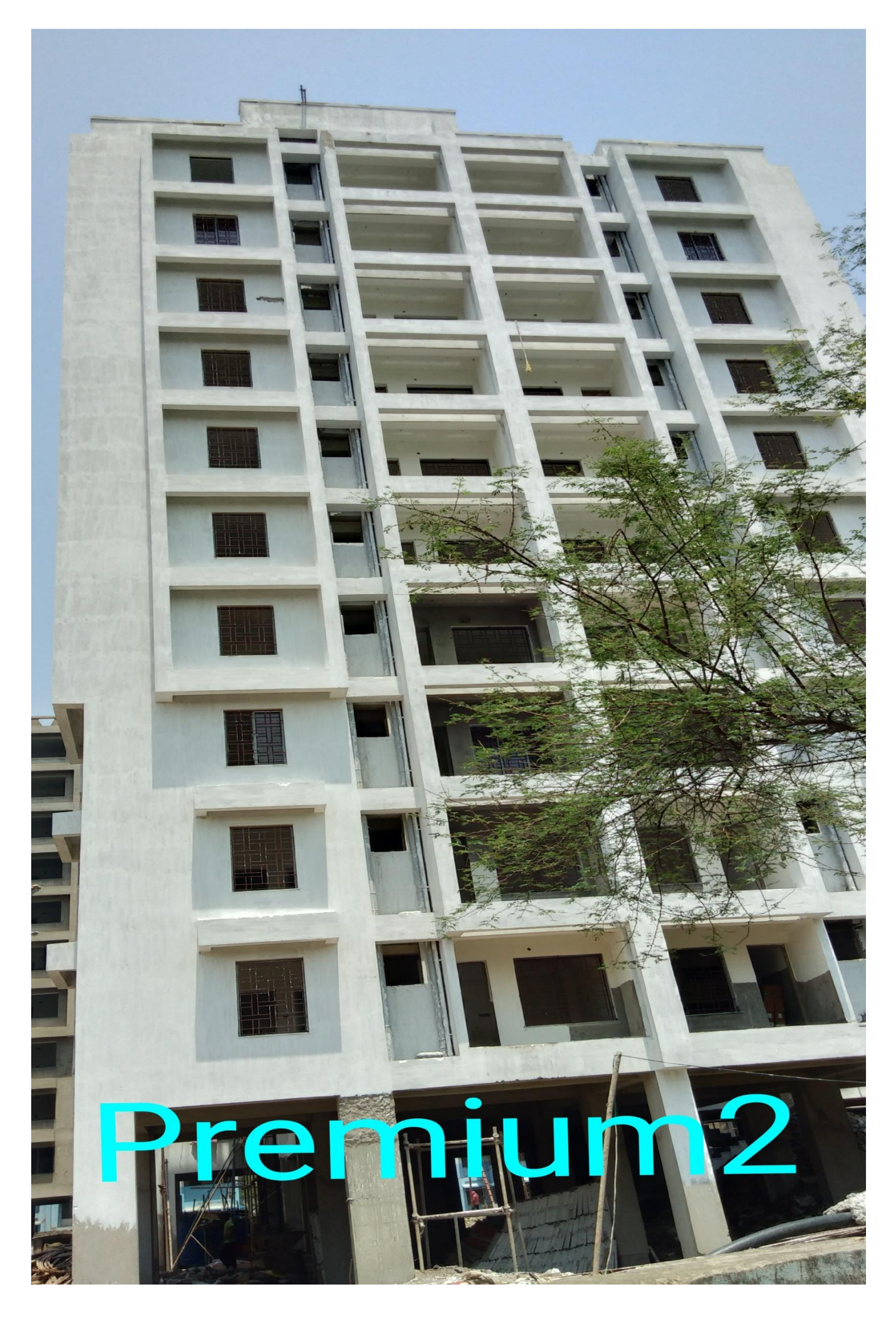
PREMIUM – 2