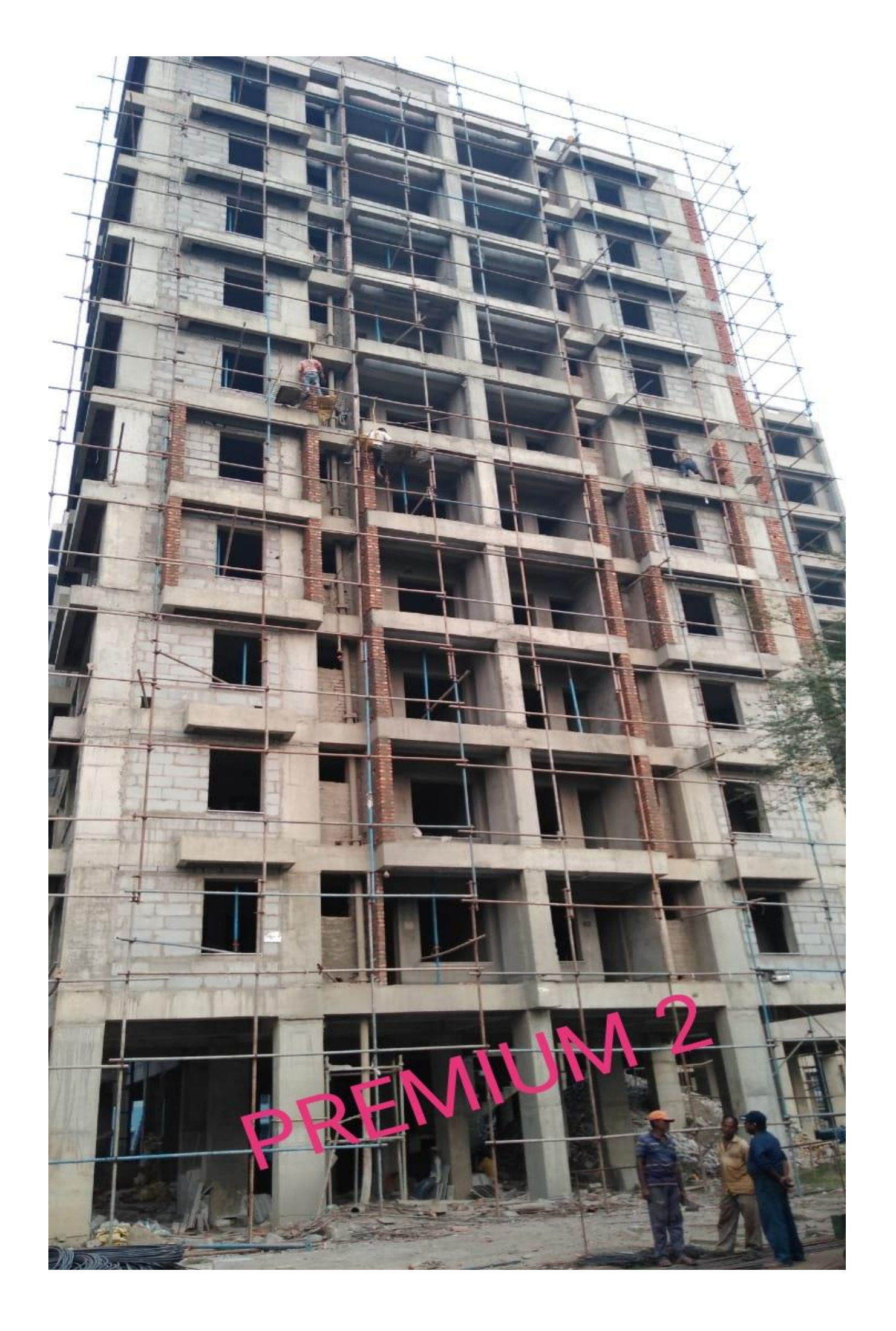
PREMIUM - 2