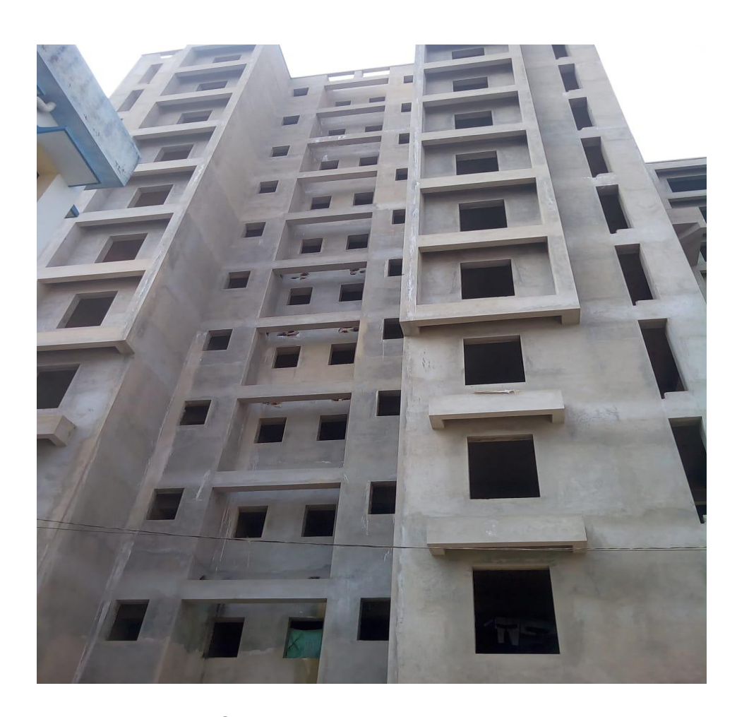
Classic –Tower no-1