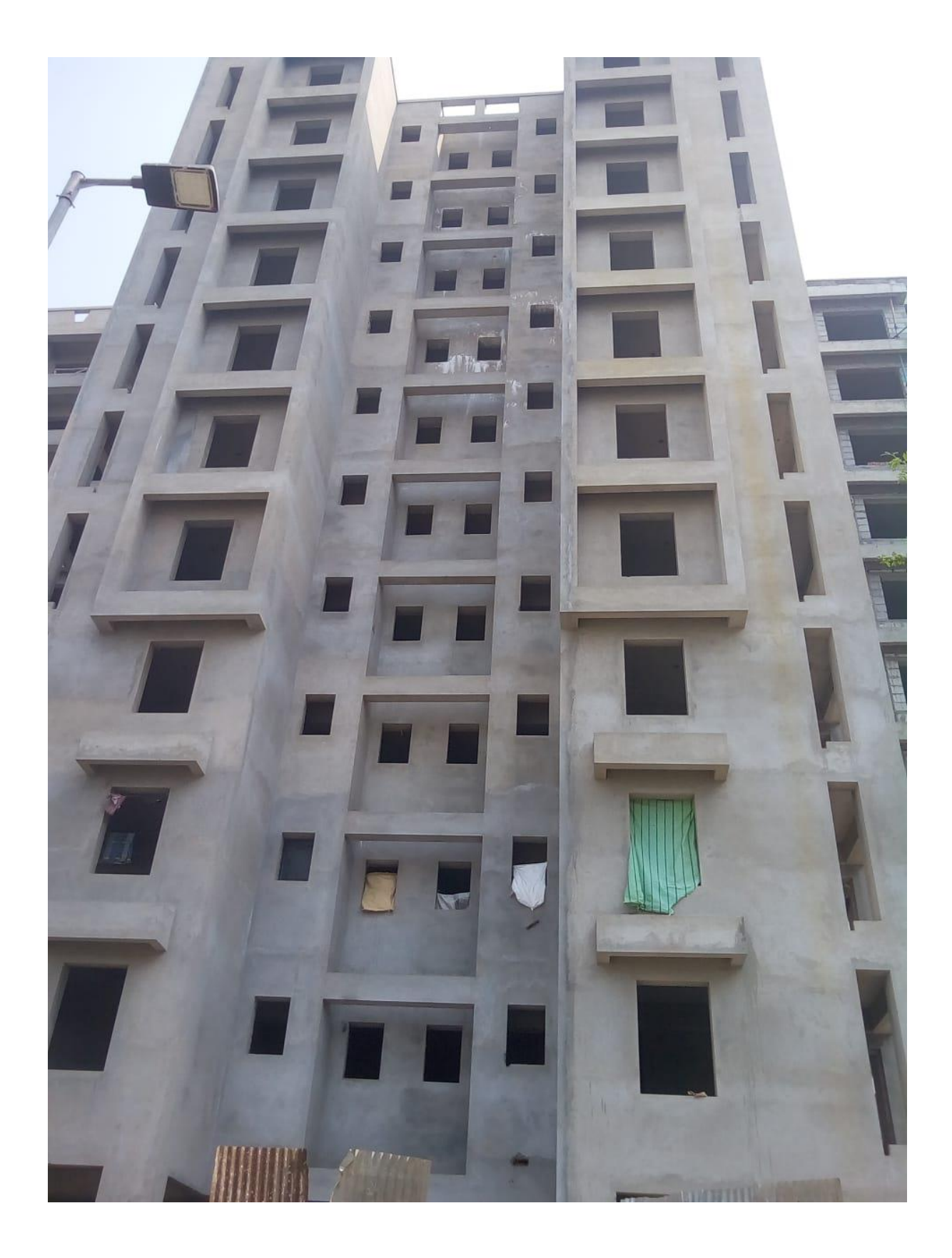
Classic –Tower no-3