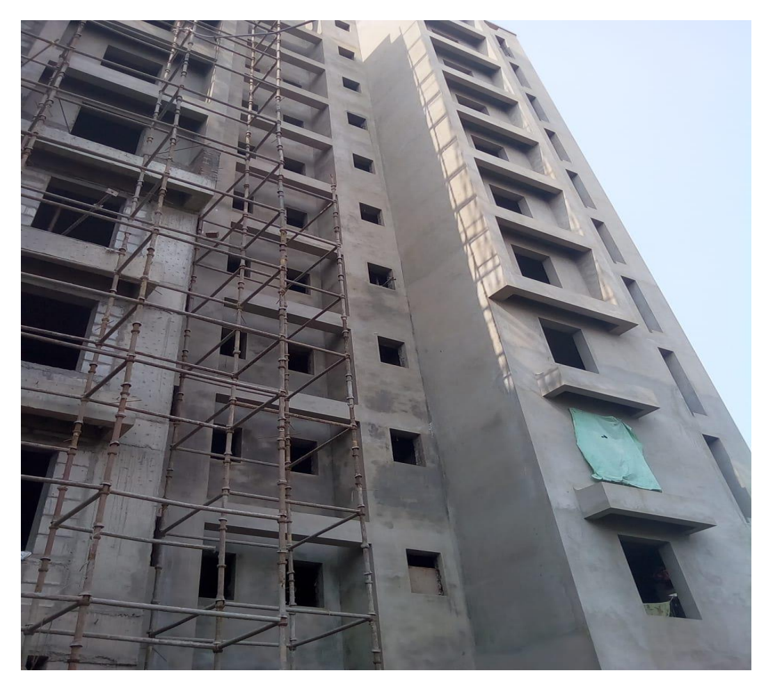
Classic –Tower no-2