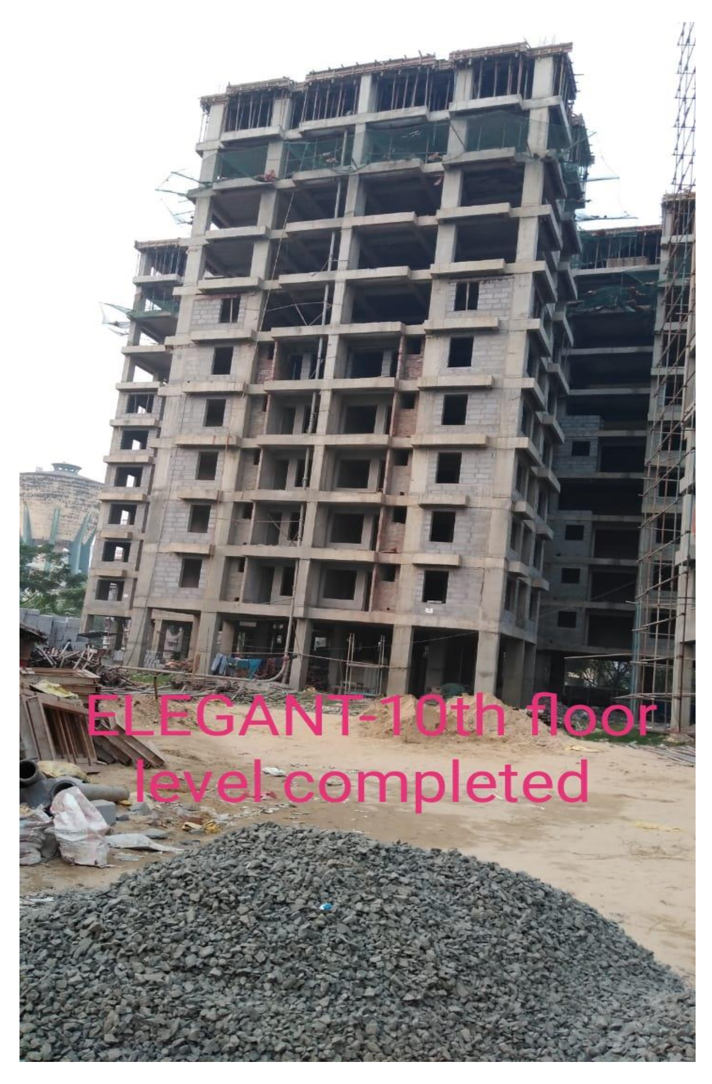
ELEGANT - 10th floor level completed