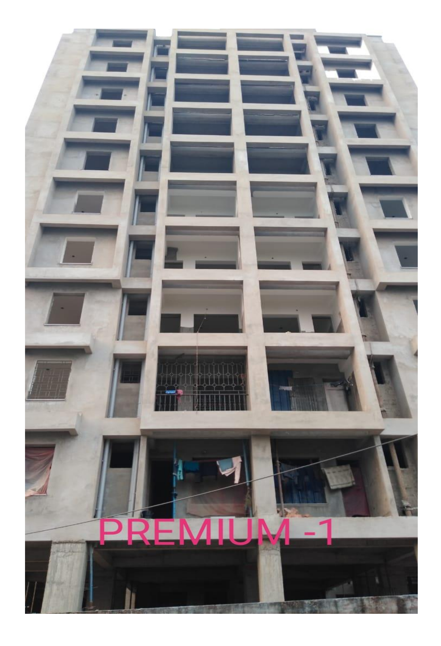
PREMIUM - 1