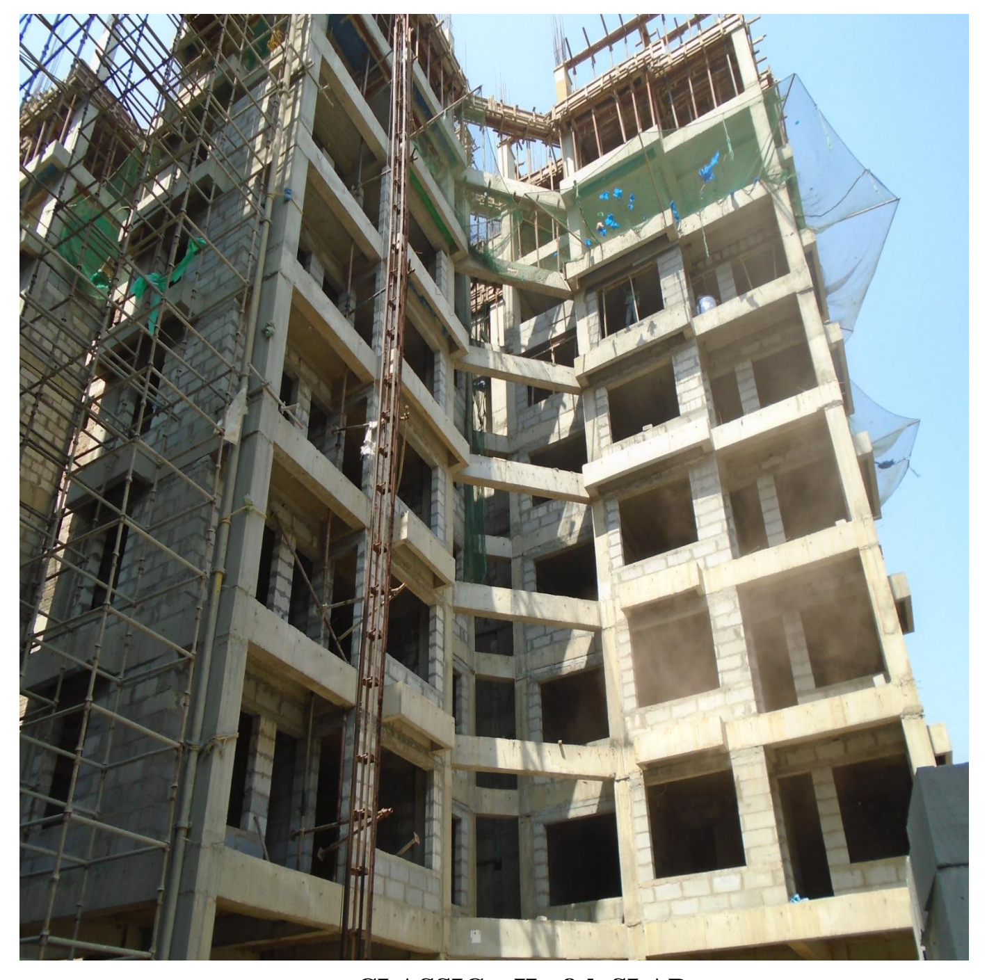
CLASSIC – II - 8th SLAB