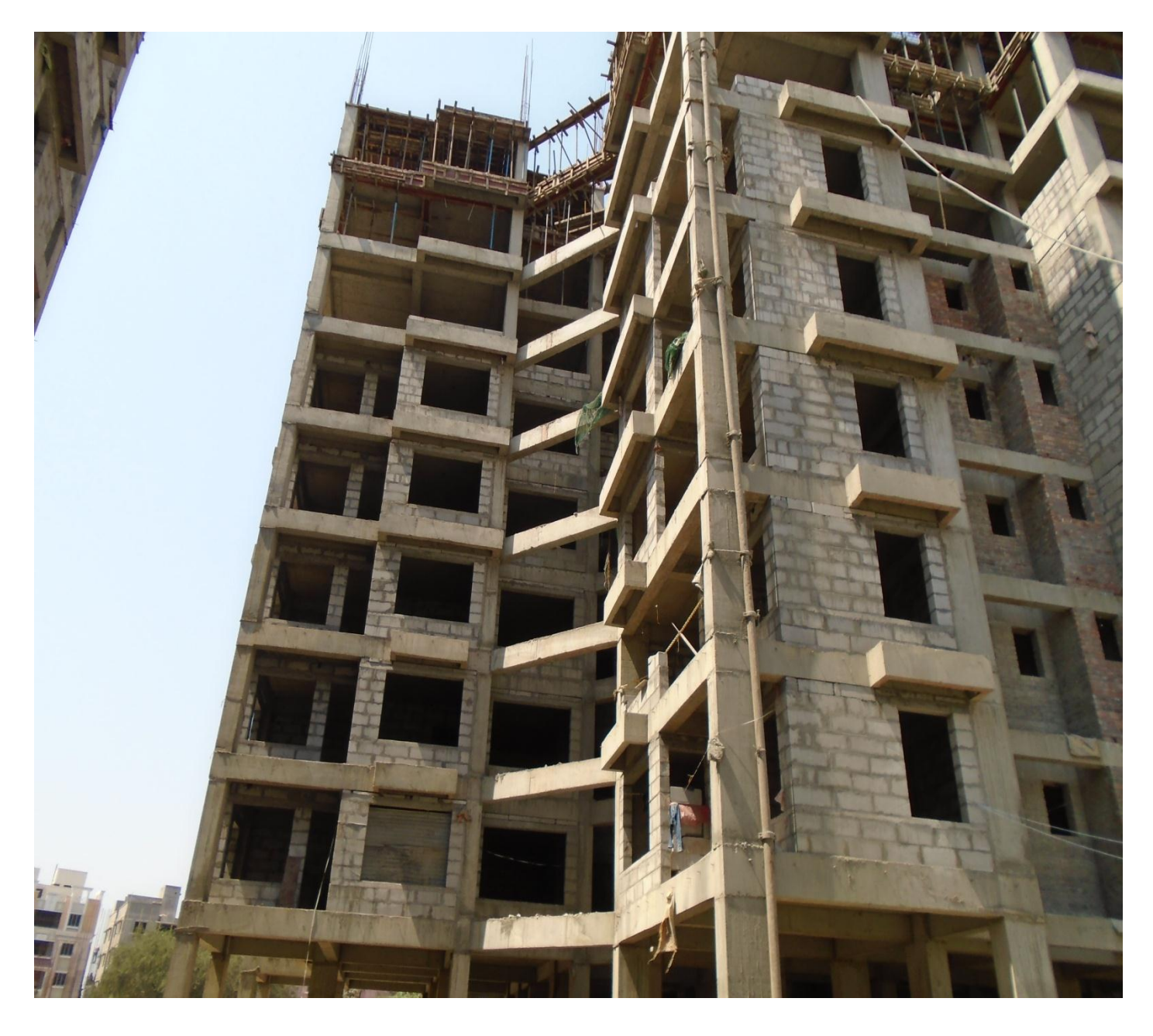
CLASSIC – III - 8th SLAB