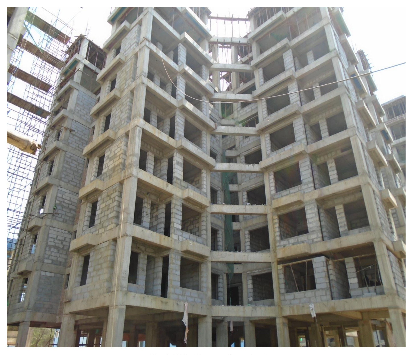
CLASSIC – I - 8th SLAB