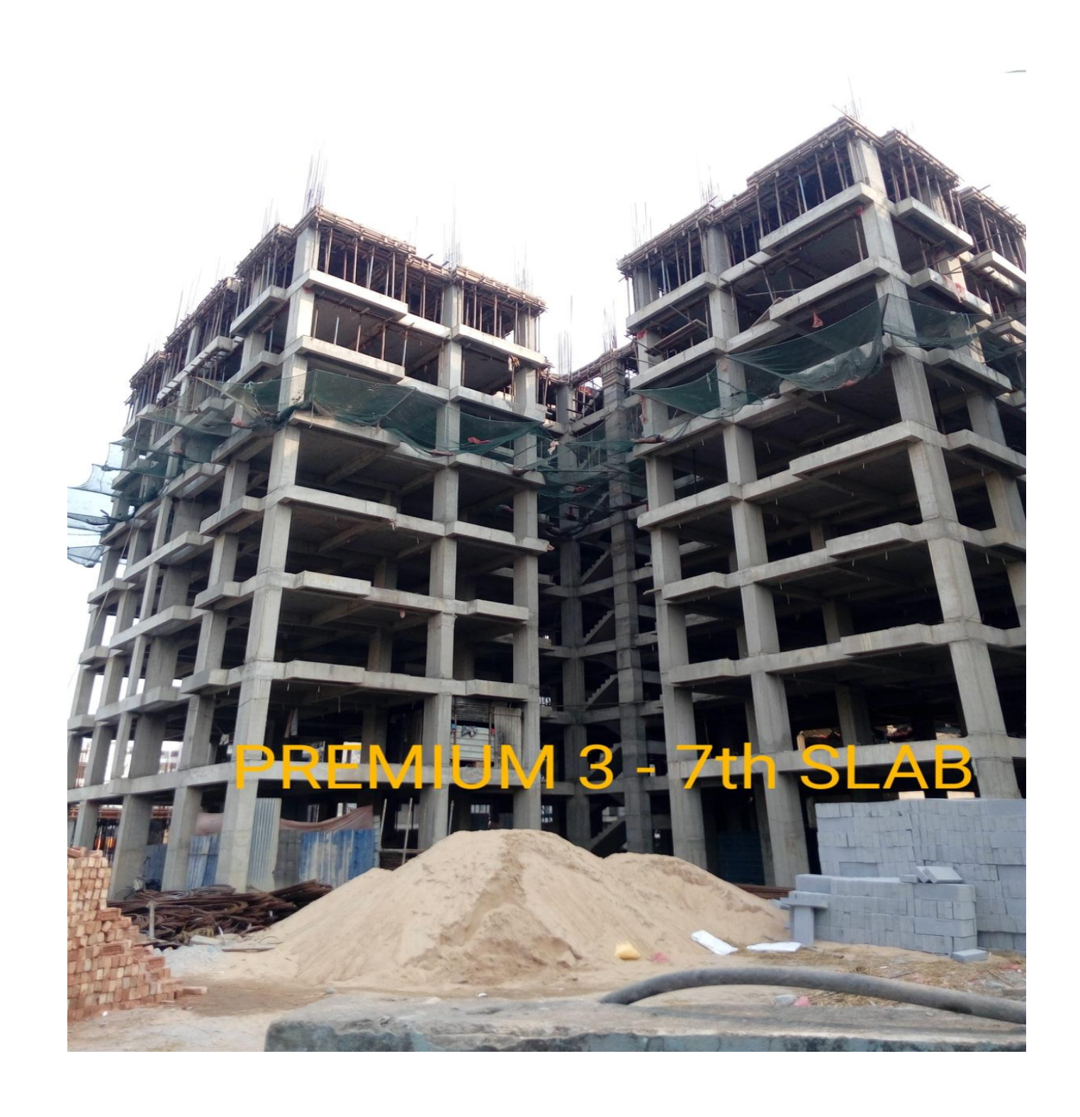
PREMIUM -3 – 7th SLAB