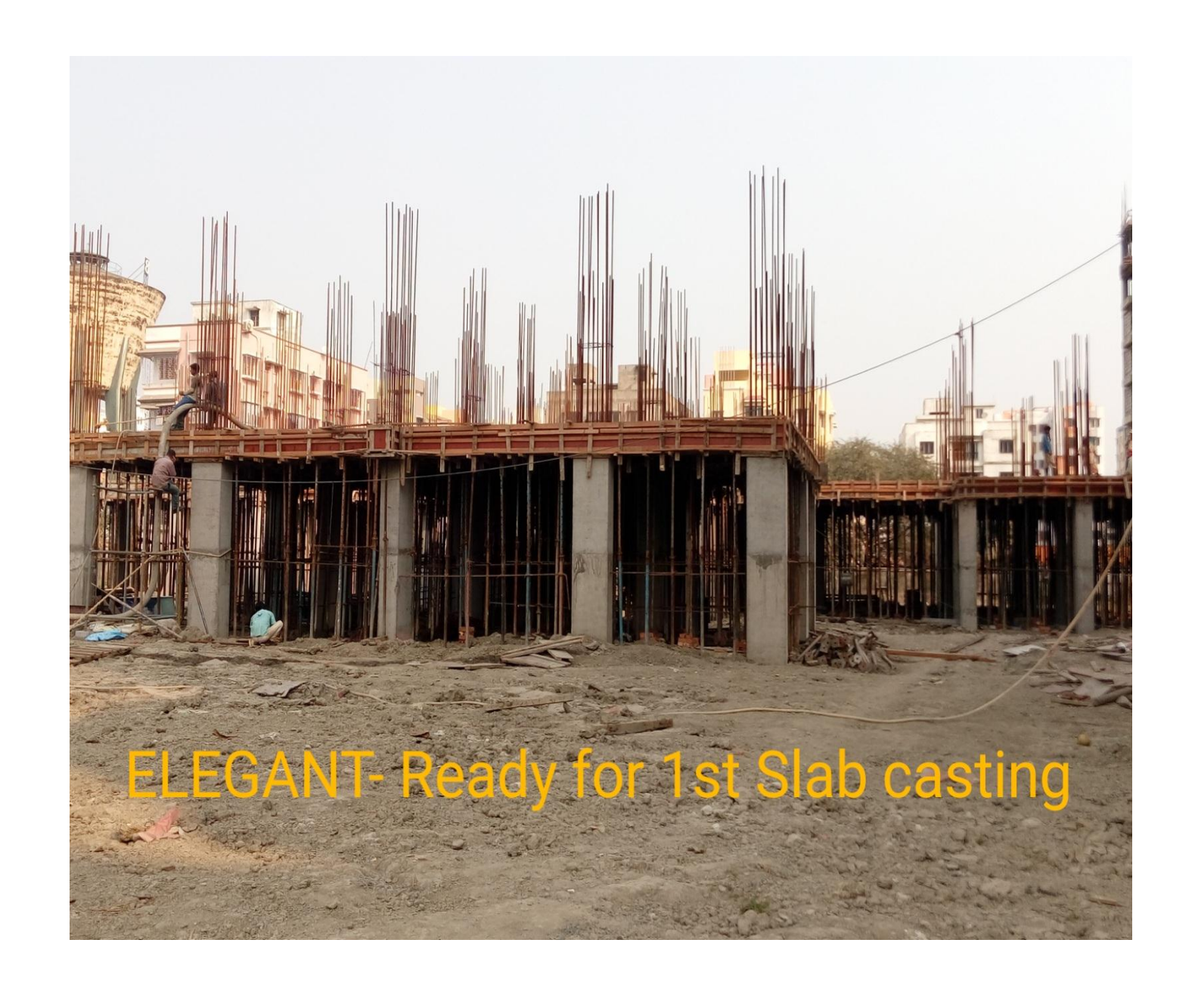
ELEGANT- Ready for 1st Slab casting