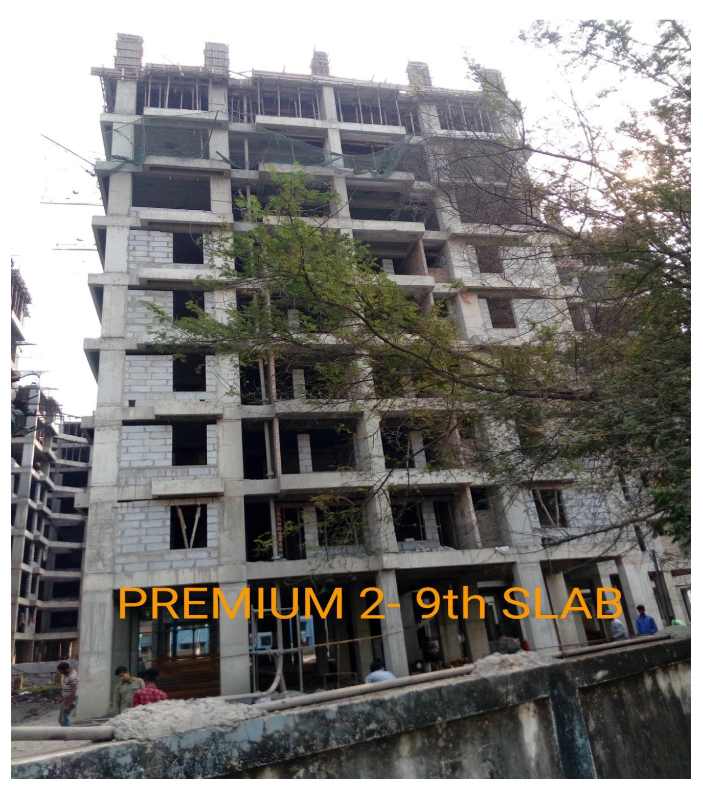
PREMIUM -2 – 9th SLAB